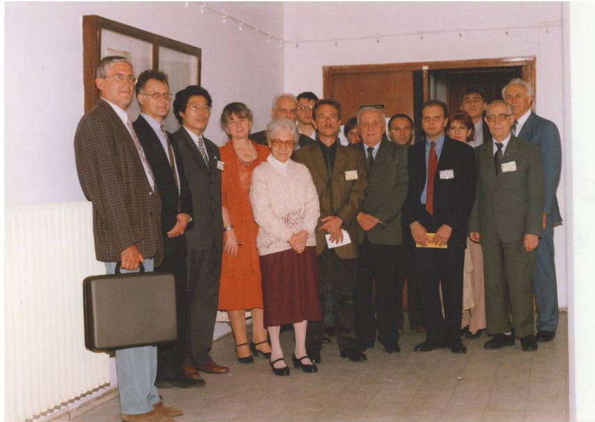
The Fifth Yugoslav Symposium on Non-linear Mechanics -NONLINEAR SCIENCES AT THE THRESHOLD OF THE THIRD MILLENNIUM (YUSNM NIŠ '2000)

11000 БЕОГРАД • Шафарикова 7 • Тел. 381 11 32 24 939